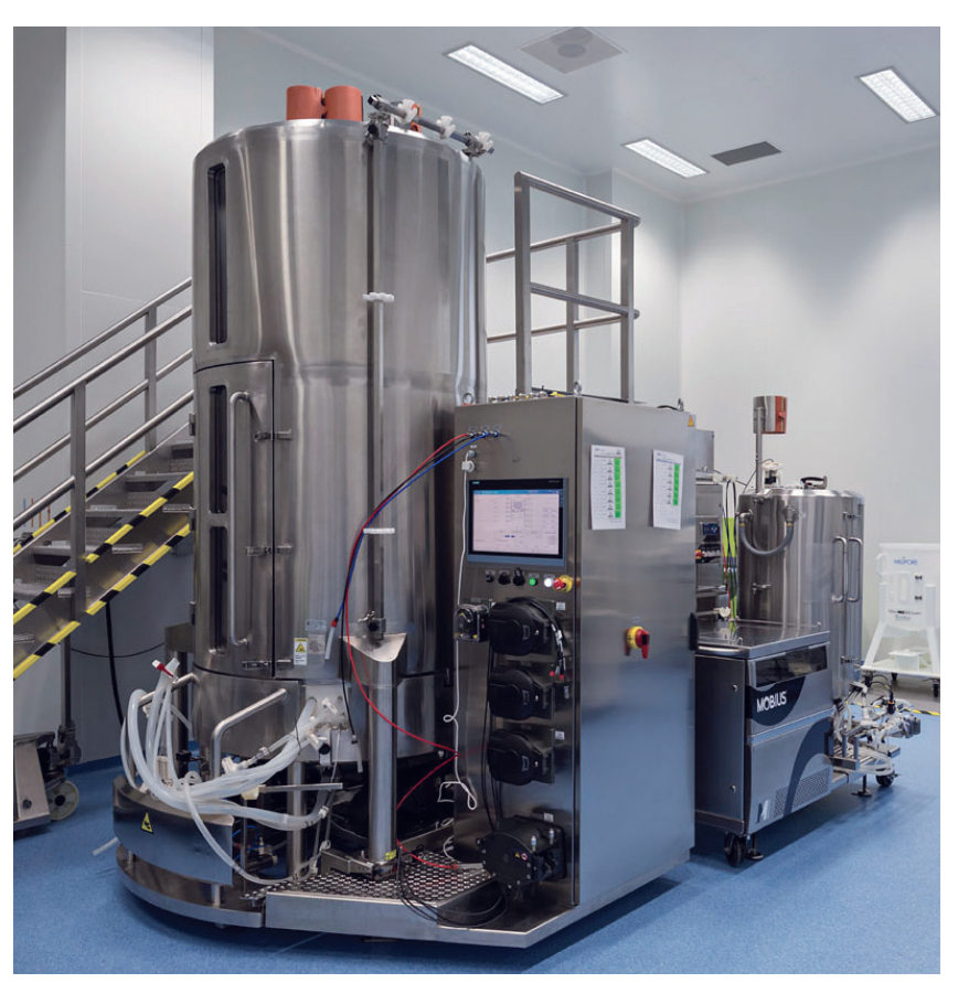
Upstream suite in a mAb manufacturing plant. A major component of a virus safety strategy is preventing viruses from entering the upstream process.

therapeutic proteins and vaccines with superior attributes, such as improved product quality, higher productivity, and shorter development timelines," asserted Dr. Mascarenhas.