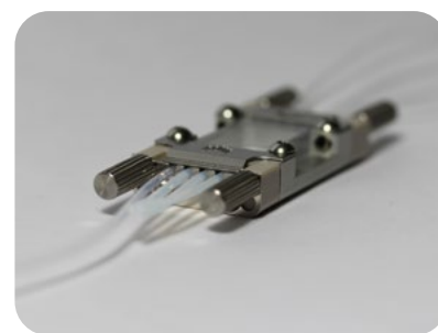
Microfluidic chip assembly in NanoFabTx™ device kit.