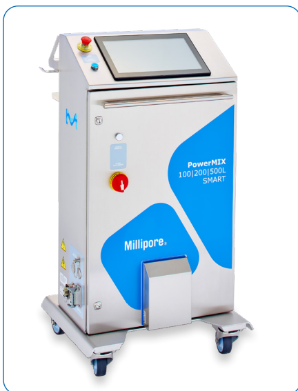
Figure 1. Smart control box

Recipe-driven automation eliminates manual operations, increases reproducibility, and minimizes risk of errors. Reports can be easily generated from scratch or from pre-defined templates. An interactive P&ID allows users to visually monitor the process and control each of the components from the Human-Machine Interface (HMI) or from anywhere through a browser-based interface.