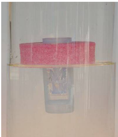
Figure 2: Dialysis with Mega Pur-A-Lyzer.