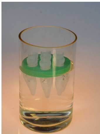
Figure 2: Dialysis with Maxi Pur-A-Lyzer.