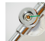
Position A: OPEN