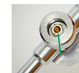
Position Z: CLOSED