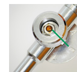
Position E: VENTING